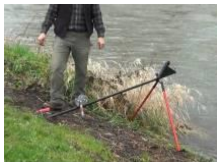
The Temporary High-Line